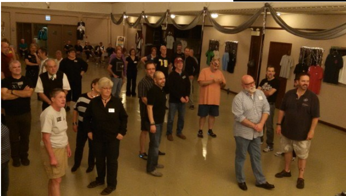
Attentively listening to announcements!"