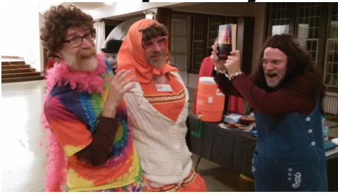
Kim Davis curses Thelma and Louise!