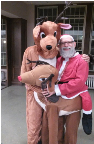
Santa's favorite reindeer!