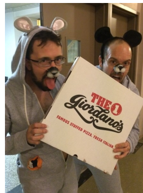
Some pizza rats were sited!