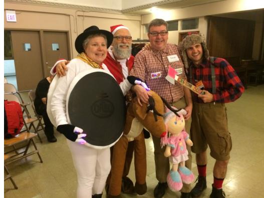
Class of '96 reunion!