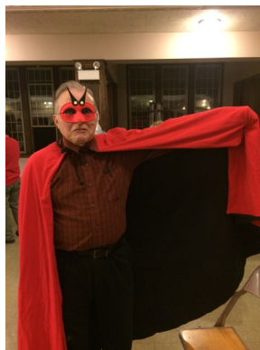
I want to suck your...blood!