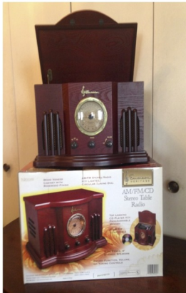
description Thanks, Patrick Pruitt! Emerson AM/FM/CD Programmable Stereo Table Radio with Rosewood Finish Estimated Value: $130.00