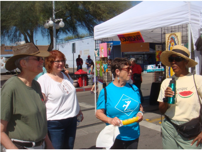
The ladies of the 4th Street Market