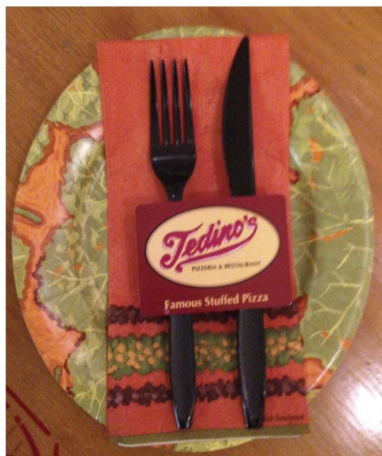
description Thanks, Tedino's Pizzeria! $25 - Gift Card