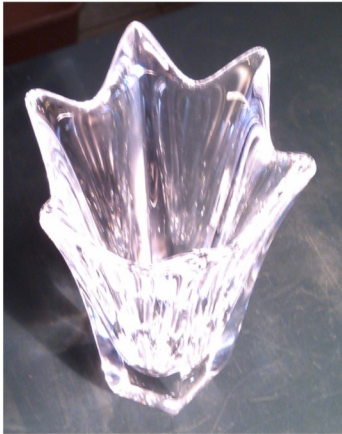
description Thanks, Phil Kouchoukos! Glass Vase Estimated Value: $25.00