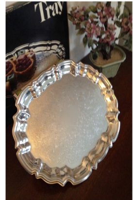
description Thanks, Patrick Pruitt! Silverplated Chippendale 12"x14" Serving Tray Estimated Value: $130.00