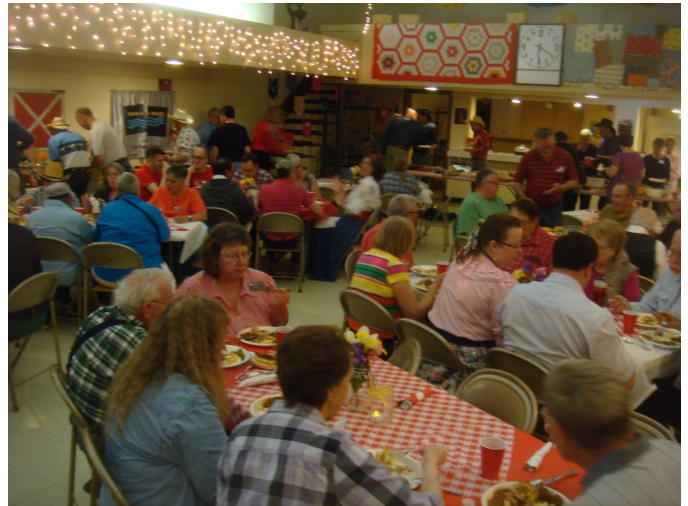
The always fabulous potluck dinner!