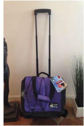
description Thanks, Patrick Pruitt! Collapsible Insulated Cooler on Wheels with Retractable Handle Estimated Value: $70.00