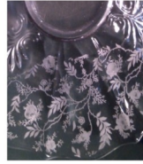
description Thanks, Phil Kouchoukos! Glass Bowl Estimated Value: $35.00