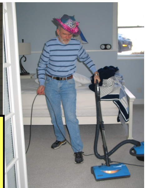
Vacuuming up glitter!

...Just what happened @ the Atlanta Fly-in that no photos have surfaced, YET!