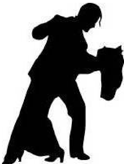
Spread & Circulate