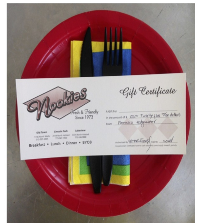
description Thanks, Nookies! $25 - Gift Card