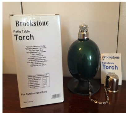
description Thanks, Patrick Pruitt! Brookstone Emerald Green Patio Table Torch (Outdoor use with citronella or standard lamp oil) Estimated Value: $130.00