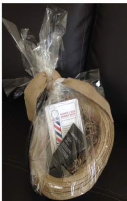
description Thanks, Father & Son Barbershop! Gift Basket #1 with Certificate for Haircut and Hairproduct Estimated Value: $35.00