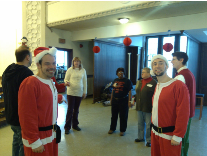
A surplus of Santas!