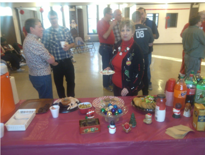
The sweets table was well stocked!