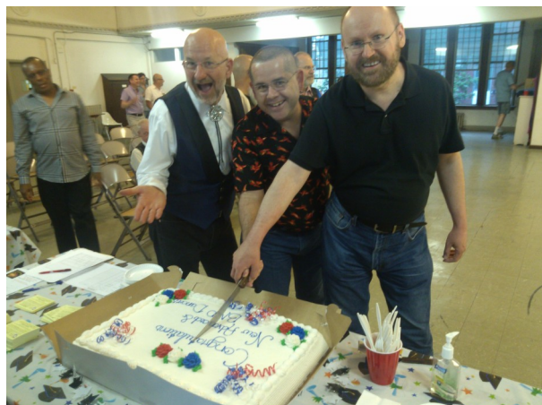
▲ We remembered to cut the cake this year!